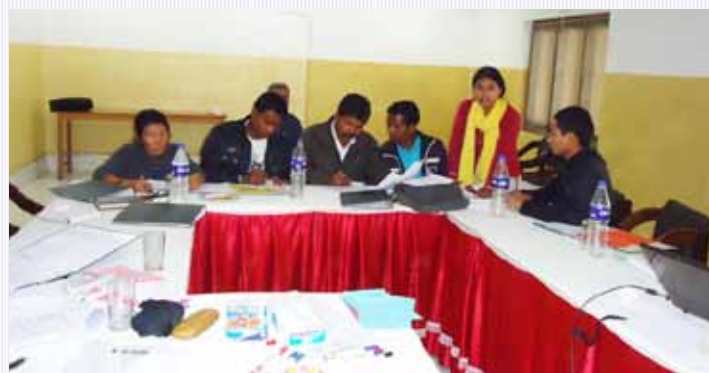
Facilitator Training, Morang