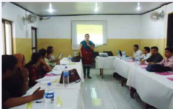
Monitoring Training (Facilitation by GESI IC), Morang