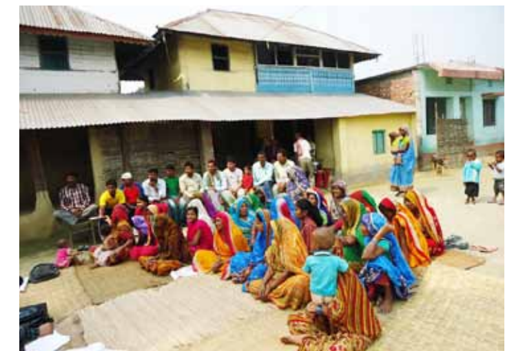
Ward Orientation, Pokhariya