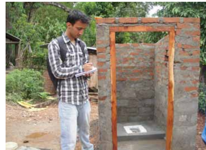
Facilitator Monitoring Sub-project, Jagatradevi