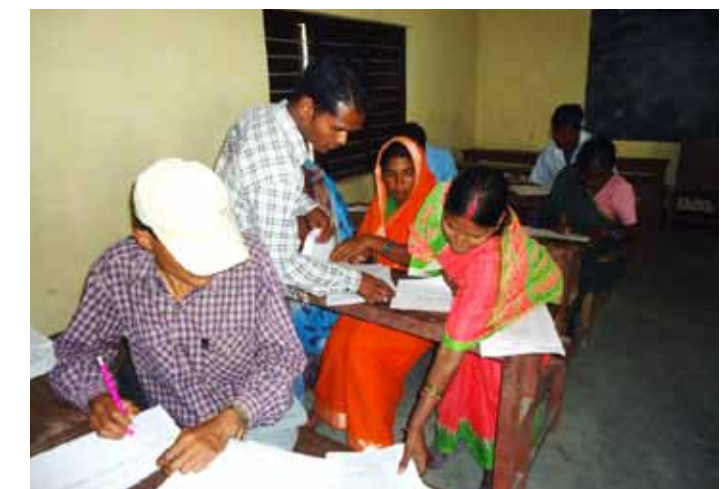
Facilitating Proposal Prioritization, Tetariya

workshop of GeMSIP. With this involvement, I expect GeMSIP will be a successful project. Also, other VDCs, finding the GeMSIP model effective, started to implement it.