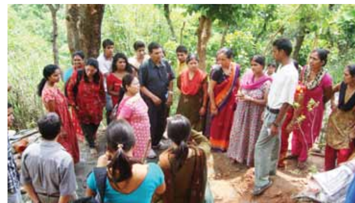
LDO and WDO interacting with users groups, Syangja