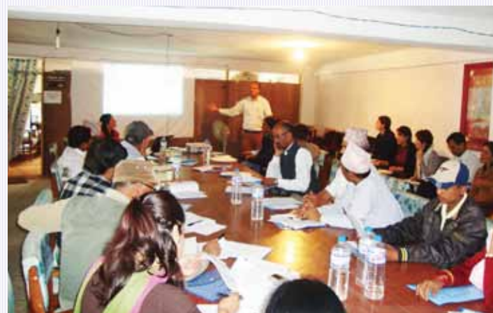
Monitoring Training (Facilitation by GESI IC), Syangja