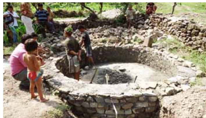
Monitoring Construction of Water Collection Tank, Tandi