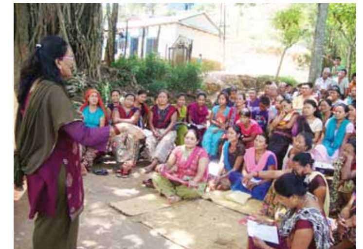
GMSI Awareness Raising Training at Jagatradevi