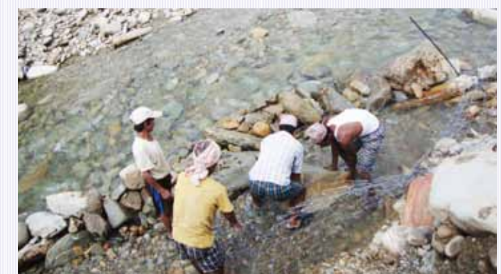
Road repair and retaining wall, Phedikhola