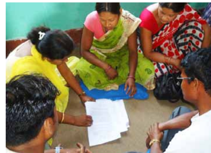
Contract Sign, Tetariya